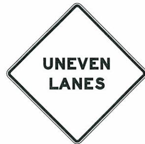
UNEVEN LANES SIGN

W8-9 48 x 48 16.00 SF COLOR: LEGEND AND BORDER: BLACK (NON-REFLECTORIZED) BACKGROUND: FLUORESCENT ORANGE (REFLECTORIZED)