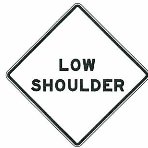
LOW SHOULDER SIGN

W8-9 48 x 48 16.00 SF COLOR: LEGEND AND BORDER: BLACK (NON-REFLECTORIZED) BACKGROUND: FLUORESCENT ORANGE (REFLECTORIZED)