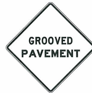
GROOVED PAVEMENT SIGN

W8-12 48 x 48 16.00 SF COLOR: LEGEND AND BORDER: BLACK (NON-REFLECTORIZED) BACKGROUND: FLUORESCENT ORANGE (REFLECTORIZED)