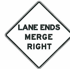
LANE ENDS MERGE RIGHT SIGN

W9-2(L) 48 x 48 16.00 SF COLOR: LEGEND AND BORDER: BLACK (NON-REFLECTORIZED) BACKGROUND: FLUORESCENT ORANGE (REFLECTORIZED)