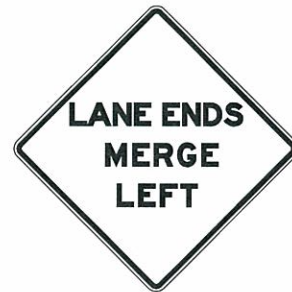
LANE ENDS MERGE LEFT SIGN

W8-17P 18 x 36 4.50 SF COLOR: LEGEND AND BORDER: BLACK (NON-REFLECTORIZED) BACKGROUND: FLUORESCENT ORANGE (REFLECTORIZED)