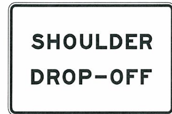
SHOULDER DROP-OFF (PLAQUE) *

W8-17 48 x 48 16.00 SF COLOR: LEGEND AND BORDER: BLACK (NON-REFLECTORIZED) BACKGROUND: FLUORESCENT ORANGE (REFLECTORIZED)