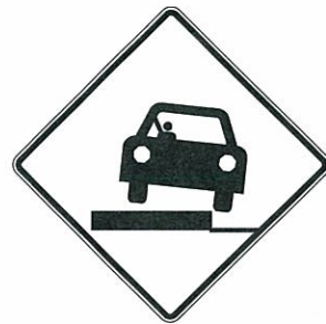
SHOULDER DROP-OFF (SYMBOL)

* SUPPLEMENTAL SIGNS SHALL ONLY BE USED IN CONJUNCTION WITH DIAMOND SHAPE CONSTRUCTION WARNING SIGNS. THE SIZE OF SUPPLEMENTAL SIGNS SHALL BE APPROPRIATE FOR USE WITH A 48 INCH X 48 INCH WARNING SIGN UNLESS OTHERWISE NOTED IN THE PLANS.