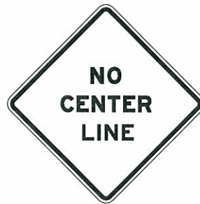
NO CENTER LINE SIGN

W8-11 48 x 48 16.00 SF COLOR: LEGEND AND BORDER: BLACK (NON-REFLECTORIZED) BACKGROUND: FLUORESCENT ORANGE (REFLECTORIZED)