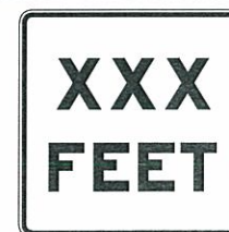
XX FEET SIGN *

COLOR: LEGEND AND BORDER: BLACK (NON-REFLECTORIZED) BACKGROUND: FLUORESCENT ORANGE (REFLECTORIZED)