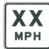
ADVISORY SPEED SIGN *

W12-2 48 x 48 16.00 SF COLOR: LEGEND AND BORDER: BLACK (NON-REFLECTORIZED) BACKGROUND: FLUORESCENT ORANGE (REFLECTORIZED)