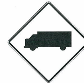
TRUCK CROSSING SIGN

W9-2(R) 48 x 48 16.00 SF COLOR: LEGEND AND BORDER: BLACK (NON-REFLECTORIZED) BACKGROUND: FLUORESCENT ORANGE (REFLECTORIZED)